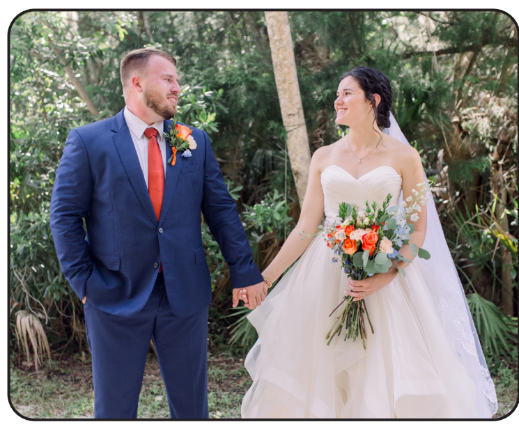
The Wedding — August 10th