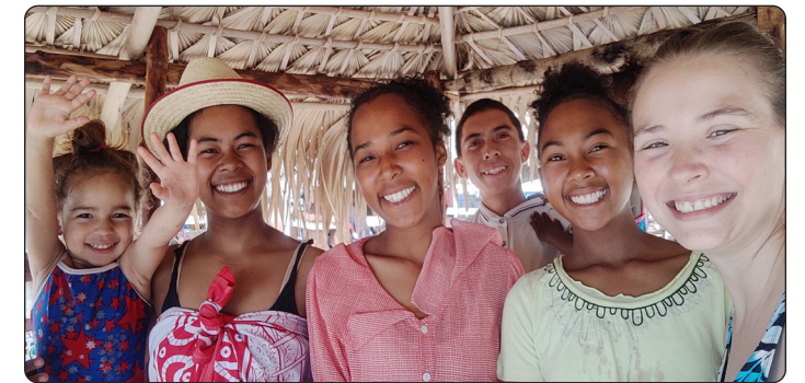
Taking Our Family to the Beach