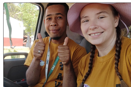
Going to Pick Up the Teams

God has been teaching us first that we need to observe; it's important to learn from other people and to be patient with ourselves in the learning process. We feel that God has been putting us through lots of tests to build our perseverance. God knows our hearts and He will find us faithful to Him and His Truth. We've been trying to be humble in