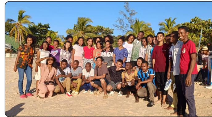
Baptism of Bible School Students