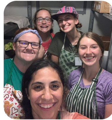
The Kitchen Crew in Australia!

crew, in the office, and different odds and ends. I personally helped in the kitchen cooking for the entire Boot Camp. It was a lot of hard work, but we had such a blast! The Australia base sent out three different national teams; one to Madagascar, one to the Solomon Islands, and one to Fiji. All the teams recently finished up, and are all back home now. It was wonderful to have this opportunity and experience! God is good. I'll be sure to include one of my MANY pictures of the kangaroos that were around us on the property!