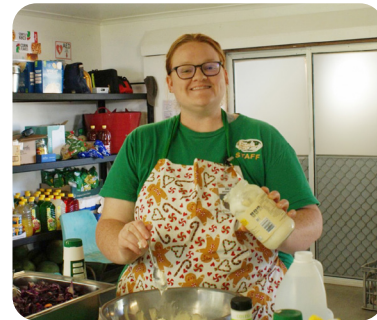
Cooking for Boot Camp.