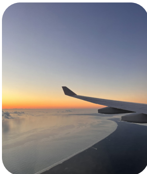
Landing early morning in Brisbane, Australia. God's an amazing artist!