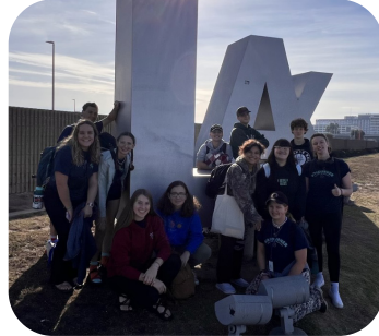
Students in LA during our layover.

As I said in my last newsletter, I was teaching a class to the Bible school students last term, Christian Evidences. The course wrapped up on November 30th. I had a wonderful time teaching this class, and definitely learned a lot through it as well. This term (January-March) I'm teaching another class for the school, Cross-Cultural Communications. I've taught this class before, so I'm having a blast teaching it again. I love spending time with these students. Speaking of students, we added another student in January. There are now 13 students at the school! Praise the Lord! Work is going well as I continue to Coordinate the Sojourner School of Ministry and work in finance. Things are busy with year end things and tax season, but going well. I'm thankful for God's guidance in all that He has me doing. I appreciate your prayers, that I would be diligent and honoring to Him in all that I do!