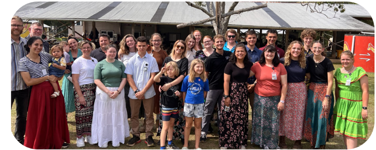
The volunteer group for the Aussie Boot Camp.

grateful for each of you. I am praying for more ministry partners to come alongside me. I would like to raise around $600 more each month to meet my monthly budget through Teen Missions. I ask you to prayerfully consider partnering with me through the ministry of Teen Missions. Here's a link to the online donation portal: https://teenmissions.org/missionary/brumbelow .