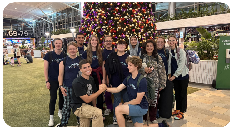
Heading home for Christmas.