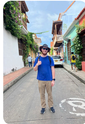
Me in the streets of historic Cartagena

the sunset together in the balmy Colombian air. It was a very relaxing time, and it would be difficult to overstate how much we appreciated the generous gift and how much God provided for us.