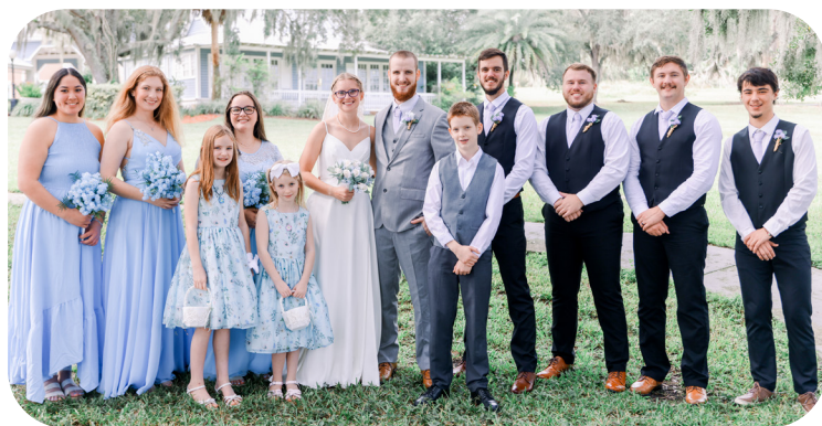
The full wedding party

After the ceremony, we stayed the night at the hotel across the street from the venue and woke up bright and early at five o'clock in the morning to catch our bus to the Miami Airport. About an hour in, the bus broke down. The driver called for a replacement bus, but the company sent a mechanic instead, who spent the better part of an hour and a half fixing the bus before we got underway again. This delay caused us to be very late to our check in at the airport. God was still watching out for us, though, and the security checkpoint ushered us to a special line to get through and make it to our flight to Cartagena, Colombia, on time. Having such a beautiful and exotic honeymoon location was another great blessing. Several months prior, we were gifted a voucher for a vacation agency that was able to cover almost the entire cost of our four day stay in South America. While in Cartagena, we were able to see the historic Spanish Inquisition city and experience the lively, tightly-packed streets and markets the city had to offer. In the evenings, we were able to sit out on our room's balcony and watch