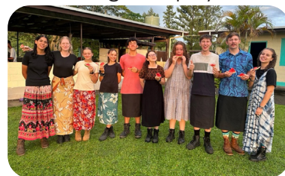
Our awesome, crazy, and hilarious team

After our time in Fiji, we flew back to Australia for a time of debriefing before heading back home. On our sightseeing day, while we were at an inflatable water park a girl from another team had slipped and fallen into the lake and another girl had also slipped and landed on the first girl’s neck. She later said that she lost consciousness briefly while in the water, but somehow managed to pull herself out of the water back onto the inflatable where she then couldn’t move. The lifeguards brought her back to the shore where we had a leader with us who was a trained EMT. He was worried about a serious neck injury so they did not move her. She was complaining about weakness and neck pain and she also kept losing consciousness. The kids from the other teams began to pray for her. The ambulance arrived and took her to the hospital and for the rest of the day, everyone was very concerned about her. That night she walked back into Debrief while