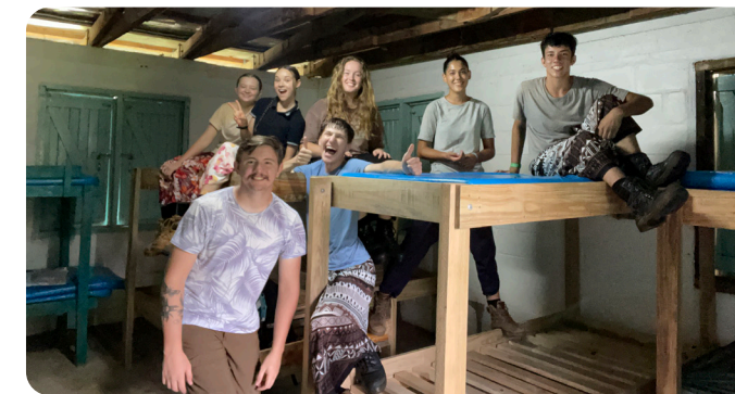
Some of the bunk beds we made