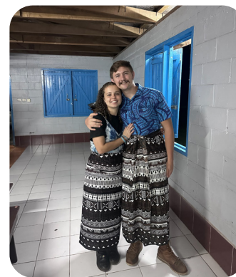
In Fiji even men wear sarongs

we were worshipping and even singing the lyrics to the song “Nothing I hold onto”, which says “I lean not on my own understanding, my life is the hands of the maker of heaven”. We saw how her life had been protected by the maker of Heaven himself and what a miracle it was that she was completely fine. Praise the Lord!