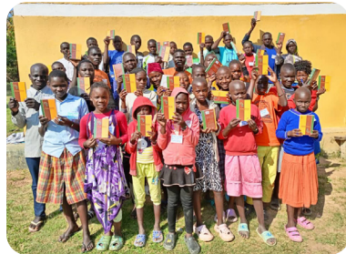
Koboko Boot Camp Bibles from Oasis

Teen Missions has just finished running 14 Boot Camps all around the world with their teens in various places on mission