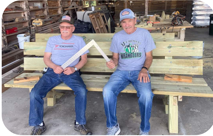
Benches made by volunteers

trips in their own countries. Not all reports are in, but there have been over 3,000 who have come to know Jesus as their Savior! Praise the Lord for that! It's the reason we are doing what we do, and it's great when God lets us see this kind of results.