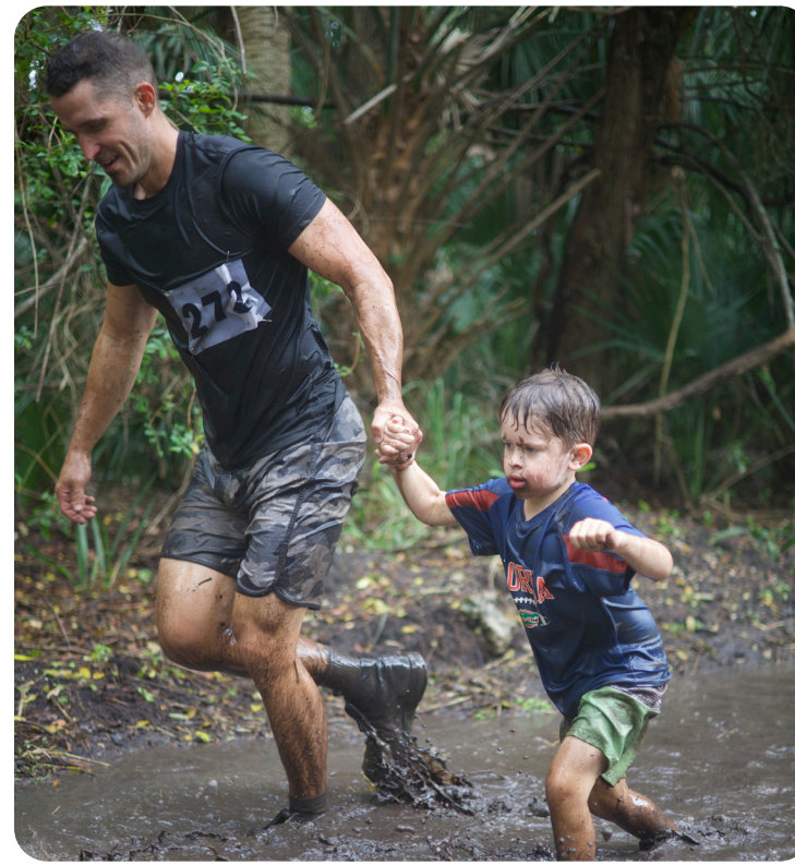
Mud Run family fun

I have been working with our administration team to develop an overseas budget (not very exciting work, but someone has to do it) and the board approved it last November. It's kind of a new thing for us, and so we are excited to keep developing and refining that process. It's a lot of work, but it feels good to get it accomplished. I'm also still auditing our overseas finances and working to develop processes for each country.