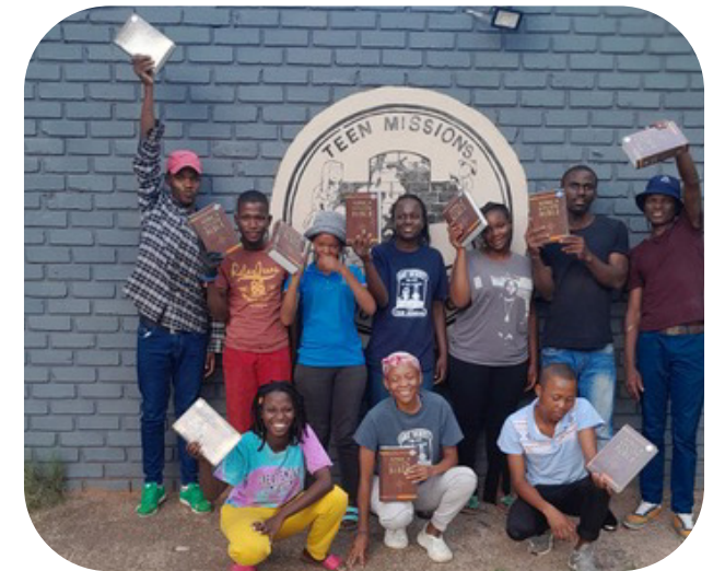
South Africa students receiving Bibles

I don't always know how to express my appreciation to all of you who support me through Teen Missions and make it possible to do the work that we do. I cannot tell you enough how much that means, not only to me personally, but also to so many people all around the world who are learning how much God loves them and wants to change their lives. THANK YOU!!