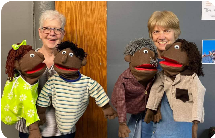
Puppets made by volunteers

Right now, we are beginning to look toward the Teen Missions Mud Run in May and, of course, our own Boot Camp shortly after that. We already have more registrations than were here at Boot Camp last year and it's only January, so we are very excited that our numbers have now increased two years in a row.