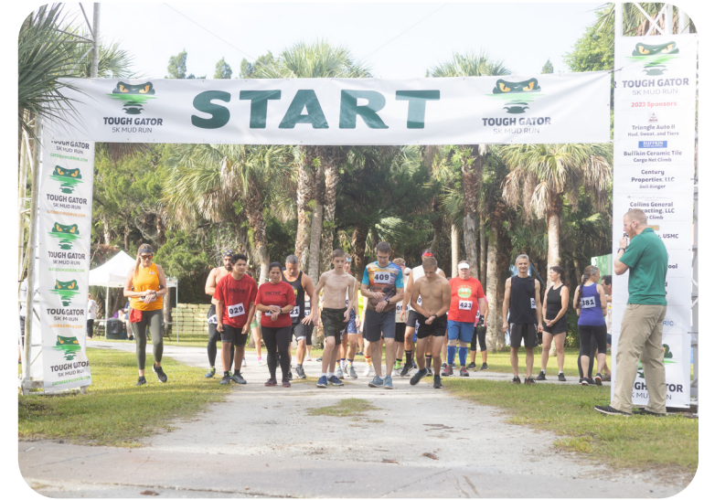
Mud Run start line

Teen Missions has begun a partnership with Oasis, which has provided Bibles for our Boot Camps and some of our Bible school students around the world. What a blessing! So many of our students and teens at Boot Camp have no Bibles available, and we are so excited that Oasis has been able to ship so many. Here in the U.S., we don't usually think about what it would