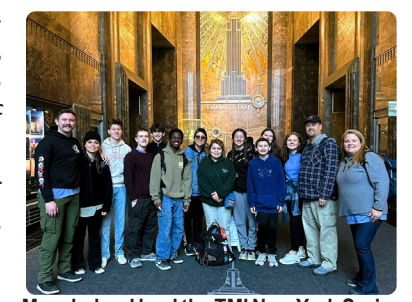
Break Trip at the end of March. During Speaking of Spring their free day, they visited NYC and took a tour of the Empire State Building.

lead a Teen Missions Spring Break trip to Yonkers, New York, which is near New York City. I, along with two staff couples, spent a week with nine teens who traveled from across the United States and Canada. They stayed at a church, Yonkers Christian Assembly, doing renovation work in their building. While