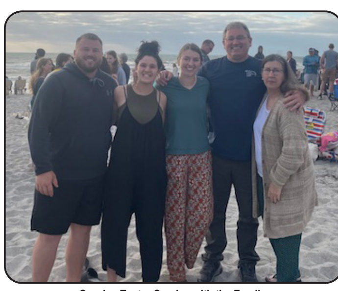
Sunrise Easter Service with the Family

met one old man who after preaching to him accepted Jesus. He knelt down before the young people to thank them, to say thank you for coming to my house to share the Word of God with me. He said there has never been anyone who has visited me to share the Word of God with me. He also asked for a Bible so that he could start reading the Word of God. The leaders of the team have invited him to visit the team so that they can give him a Bible written in our local language.